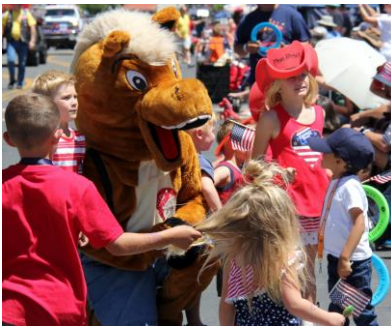
Our float helped honor "Everyday Heroes" in last month's Frontier Days Fourth of July Parade in Prescott. "Hope-a-Long" (left) was on hand to charm kids along the route.